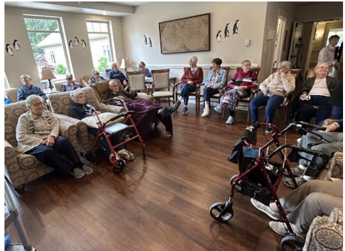
Photo: Residents at Grass Home, Riverview, enjoying an on-site presentation

After the on-site meetings, discussions continued with residents and refreshments were served. As the meetings continued, it became evident that older adults much prefer meeting in person or having the opportunity to view a recorded presentation in a group setting or as an individual at their convenience.