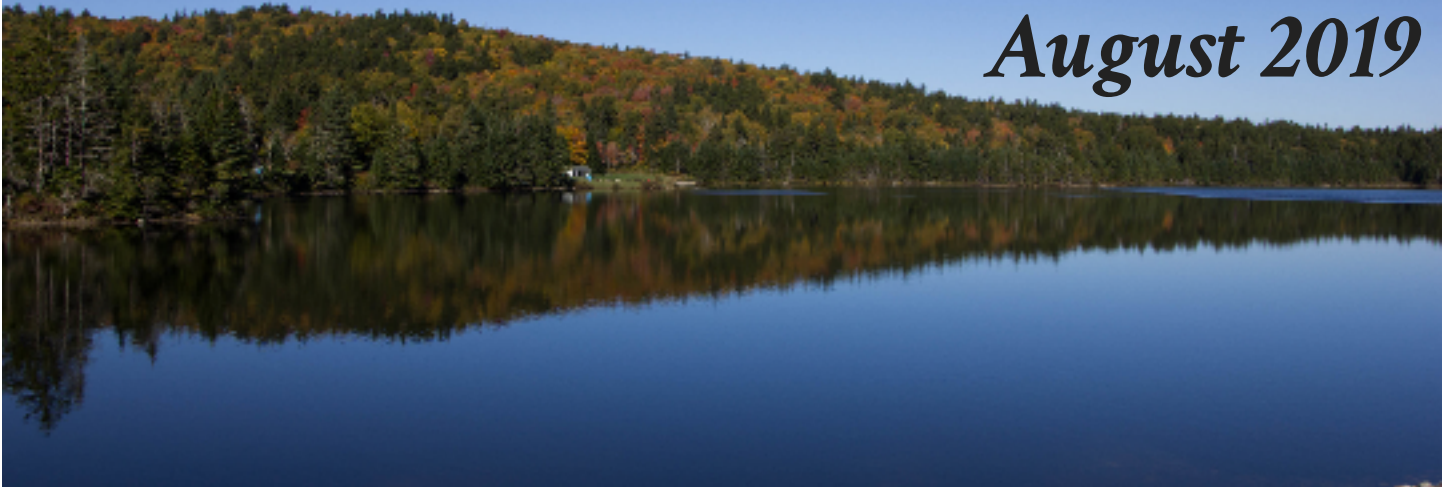
Bennett Lake, Fundy National Park