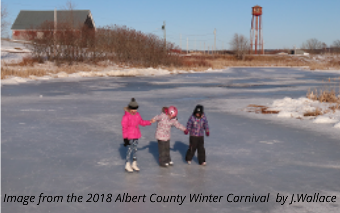
Image from the 2018 Albert County Winter Carnival