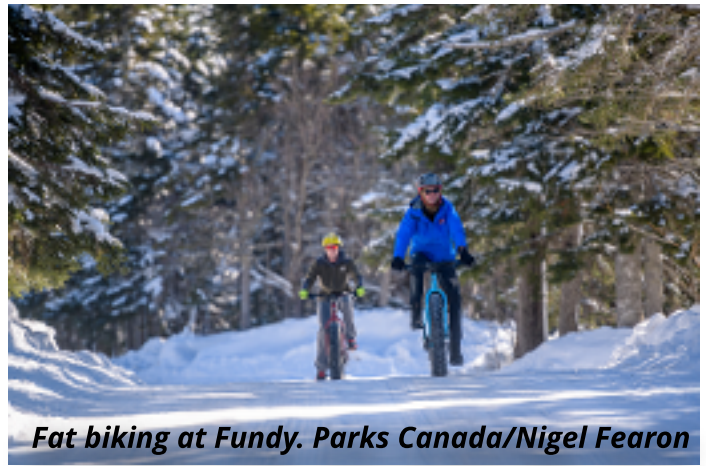
Fat biking at Fundy.

Feb. 16: Tramp & Tap The Friends of Fundy/Fundy Guild Inc. are hosting the first “Tramp & Tap” at Fundy National Park. Picture “Pedal and Pint” but with snowshoes instead of bikes! Meet at the Chignecto Pavilion at 6pm for a 1- to 1.5-hr tramp on the winter trails. Then join Friends of Fundy at Holy Whale Brewing in Alma for beer. A limited number of snowshoes are available for rent.