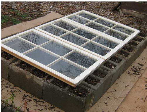
Left: cold frame;

At Farmers Brown's Greenhouse back in Osborne Corner, Lisa says brassicas (cole crops such as cabbage, rutabagas, turnips) are not their specialty, but plants like potatoes, beets, carrots, beans, and onions do really well.