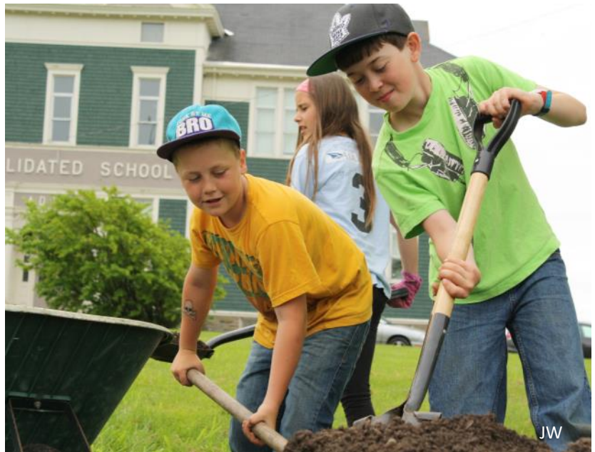
Students preparing the school garden several years ago.